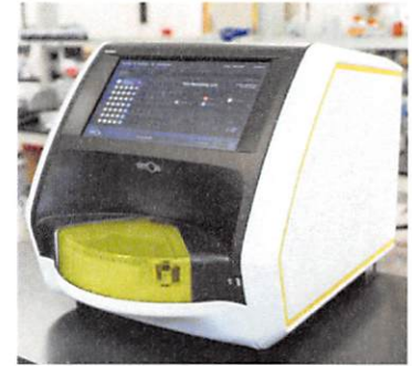
Data below represents results generated on the Quanterix SR-X™ Ultra-Sensitive Biomarker Detection System