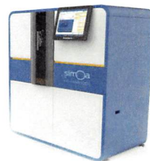
Data below represents results generated on the Simoa™ HD-1 Analyzer.