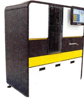
Data below represents results generated on the Simoa™ HD-X Analyzer.