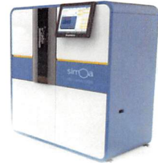
Data below represents results generated on the Simoa™ HD-1 Analyzer.