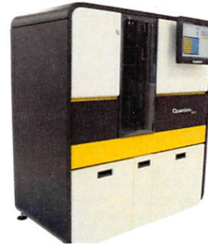
Data below represents results generated on the Simoa HD-X® Analyzer.