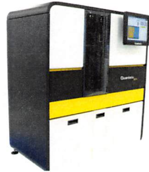
Data below represents results generated on the Simoa HD-X® Analyzer.