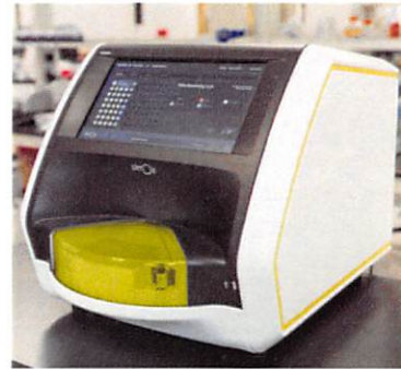
Data below represents results generated on the Quanterix SR-X™ Ultra-Sensitive