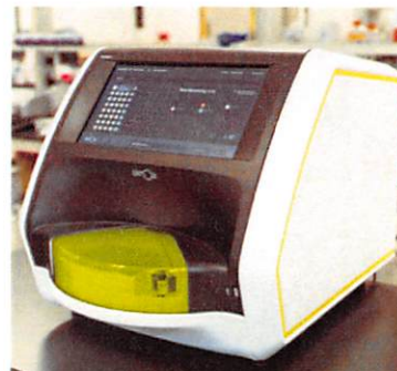
Data below represents results generated on the Quanterix SR-X™ Ultra-Sensitive

Product Number: 103400 Lot Number: 502609 Expiration: 14-Sep-2021 Platform(s): SR-X