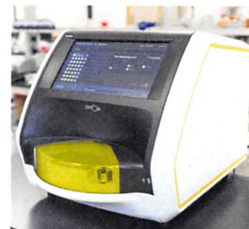
Data below represents results generated on the Quanterix SR-X™ Ultra-Sensitive Biomarker Detection System