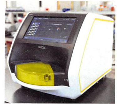
Data below represents results generated on the Quanterix SR-X™ Ultra-Sensitive Biomarker Detection System