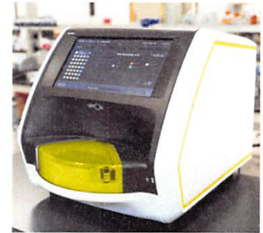
Data below represents results generated on the Quanterix SR-X™ Ultra-Sensitive Biomarker Detection System