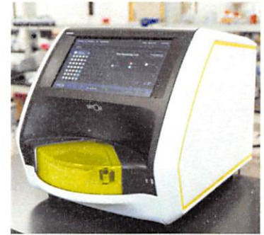
Data below represents results generated on the Quanterix SR-X™ Ultra-Sensitive Biomarker Detection System