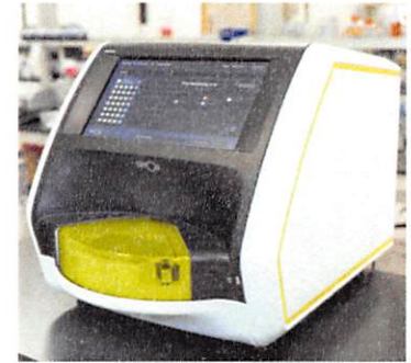
Data below represents results generated on the Quanterix SR-X™ Ultra-Sensitive Biomarker Detection System