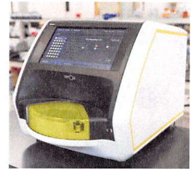
Data below represents results generated on the Quanterix SR-X™ Ultra-Sensitive Biomarker Detection System