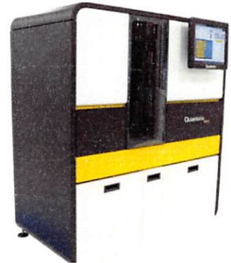
Data below represents results generated on the Simoa™ HD-X Analyzer.