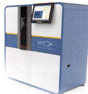
Data below represents results generated on the Simoa™ HD-1 Analyzer.