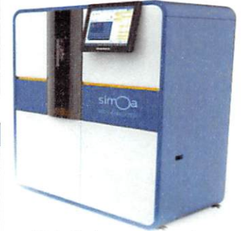
Data below represents results generated on the Simoa™ HD-1 Analyzer.