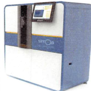
Data below represents results generated on the