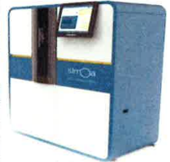
Data below represents results generated on the Simoa™ HD-1 Analyzer.