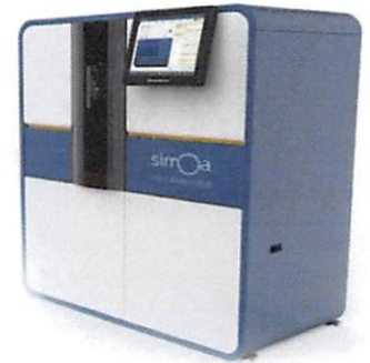
Data below represents results generated on the Simoa™ HD-1