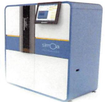
Data below represents results generated on the