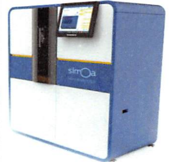
Data below represents results generated on the Simoa™ HD-1 Analyzer.