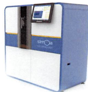
Data below represents results generated on the Simoa™ HD-1