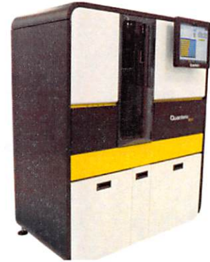
Data below represents results generated on the Simoa™ HD-X Analyzer.