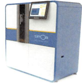
Data below represents results generated on the Simoa™ HD-1 Analyzer.