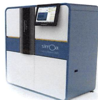
Data below represents results generated on the Simoa™ HD-1