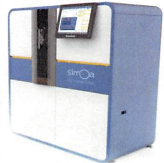
Data below represents results generated on the Simoa™ HD-1