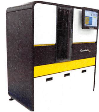
Data below represents results generated on the Simoa™ HD-X Analyzer.