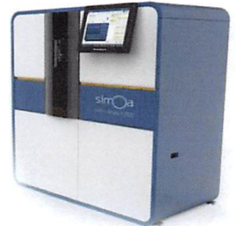
Data below represents results generated on the