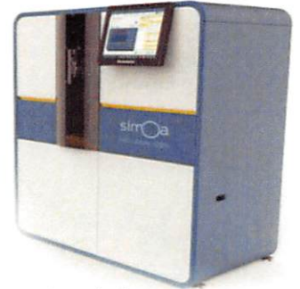
Data below represents results generated on the Simoa™ HD-1 Analyzer.