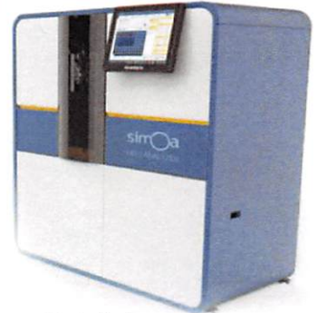
Data below represents results generated on the