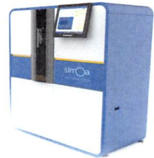
Data below represents results generated on the Simoa™ HD-1 Analyzer.