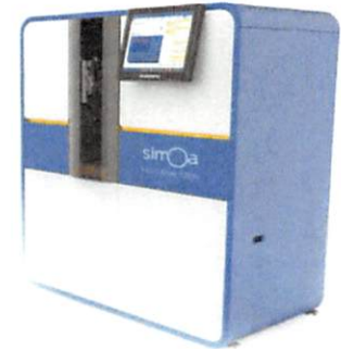
Data below represents results generated on the Simoa™ HD-1 Analyzer.