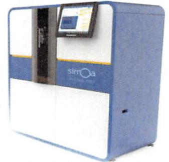
Data below represents results generated on the Simoa™ HD-1 Analyzer.