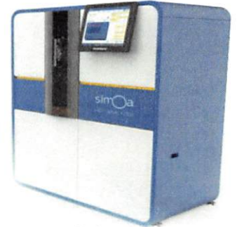
Data below represents results generated on the