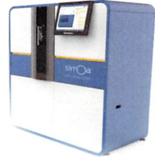
Data below represents results generated on the Simoa™ HD-1