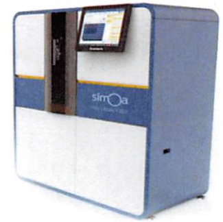
Data below represents results generated on the Simoa™ HD-1