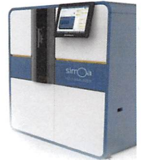
Data below represents results generated on the Simoa™ HD-1