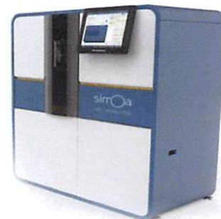
Data below represents results generated on the