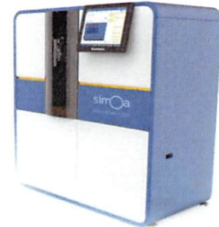
Data below represents results generated on the Simoa™ HD-1 Analyzer.