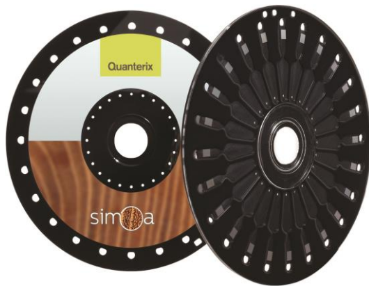
Figure 2. Simoa disc containing 24 array assemblies arranged radially. Each array contains 216,000 femtoliter-sized wells, which can contain individual beads with or without an associated immunocomplex.

with oil and imaged. Simoa permits the detection of very low concentrations of enzyme labels by confining the fluorophores generated by individual enzymes to extremely small volumes (~40 fL), ensuring a high local concentration of fluorescent product molecules. If a target analyte has been captured (that is, an immunocomplex has formed), then the substrate will be converted to a fluorescent product by the captured enzyme label (Fig. 3). The ratio of the number of wells containing an enzyme-