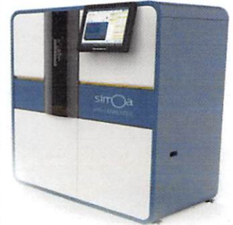
Data below represents results generated on the