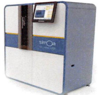
Data below represents results generated on the