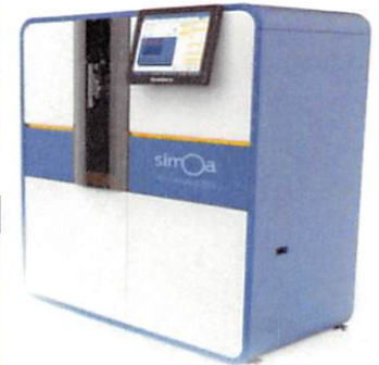
Data below represents results generated on the