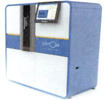
Data below represents results generated on the