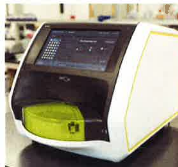
Data below represents results generated on the Quanterix SR-X™ Ultra-Sensitive