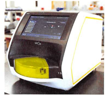
Data below represents results generated on the Quanterix SR-X™ Ultra-Sensitive Biomarker Detection System