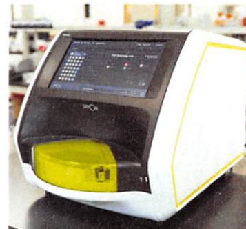
Data below represents results generated on the Quanterix SR-X™ Ultra-Sensitive Biomarker Detection System