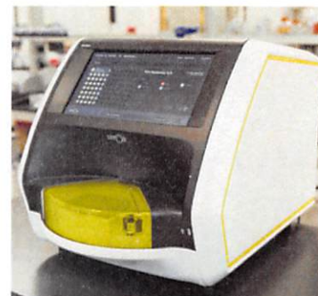
Data below represents results generated on the Quanterix SR-X™ Ultra-Sensitive Biomarker Detection System