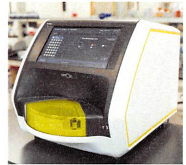
Data below represents results generated on the Quanterix SR-X™ Ultra-Sensitive Biomarker Detection System